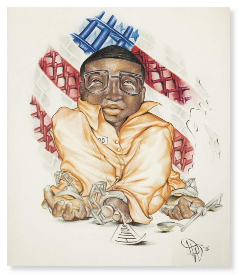
Saturday April 27th 5-10 PM

The Medallion | 334 Main St | Los Angeles 90013 | Unit 5016