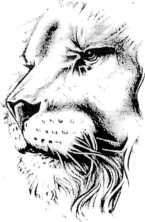
Artwork by: Chuck Esmay #D86924